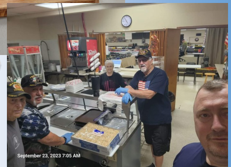
Our Riders making sure everyone got fed.