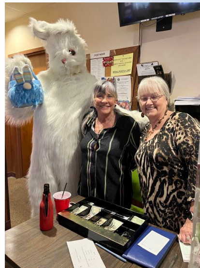
The Easter Bunny made a surprise visit to our Friday Fish Night, 4/15/22