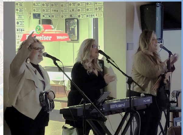
GIRLS NIGHT OUT entertaining the crowd in Club 21 after a great dinner of Fried Fish on 4/15/22!