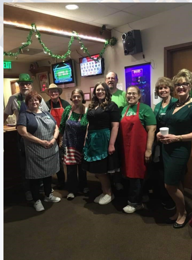
Thank you to our hard working volunteer kitchen staff. They made our day special!

A special thank you to our dedicated Friday Kitchen Volunteers. Please make sure you thank them and tell them how much you appreciate all that they do for our post.