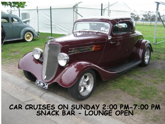
CAR CRUISES ON SUNDAY 2:00 PM-7:00 PM SNACK BAR - LOUNGE OPEN