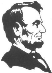
Birthdays Feb 12